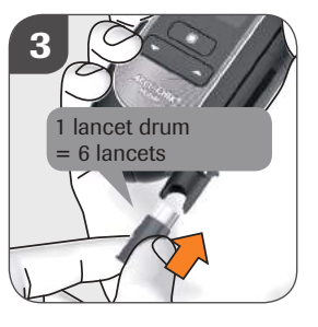
Insert the new lancet drum (white end first). You now have 6 lancets available.