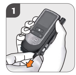
Changing the lancet drum