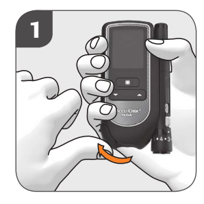
Open the tip protector to the stop. Only then can you open the cartridge compartment and insert the test cartridge.