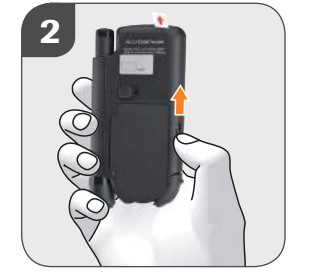
Push the locking button of the cartridge compartment lid upwards.