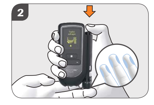
Taking a blood sample Press the lancing device firmly against the side of your finger tip. Now press the release button down all the way: only 1 click for setting and release.