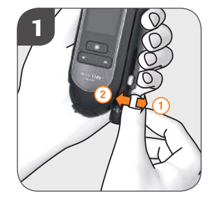
Prepare the lancing device for the next blood sample: move the lever in direction (1) and back again in direction (2).