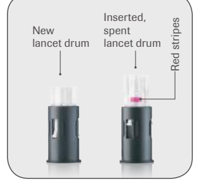
Once a lancet drum has been removed, it cannot be re-inserted. This is indicated by the red stripe.